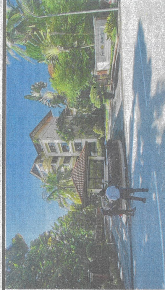
Sheets can be seen covering the slope at Seri Dutta 1 condominium.