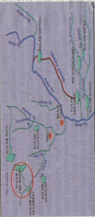
RAJAH 2 LEMBANGAN SUNGAI DAN KEDUDUKAN KOLAM TAMAN WAHYU

Sumber: JPSWPK Lembangan sungai dan kedudukan kolam Taman Wahyu.