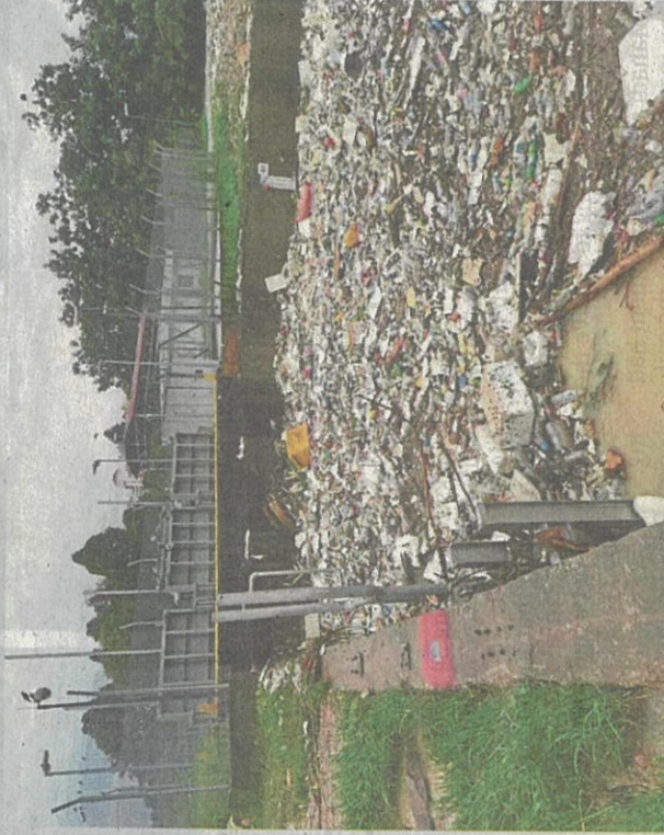
Huge amounts of floating rubbish have accumulated in flood mitigation assets under the Kuala Lumpur Drainage and Irrigation Department following the floods on Dec 18.