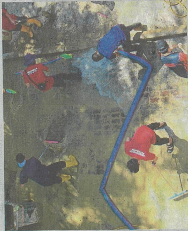
Teams from government agencies under the Federal Territories Ministry taking part in clean-up efforts in flood-hit Taman Tasik Bandar in Temerloh, Pahang.

FEDERAL Territories Ministry and agencies within its purview assigned over 1,000 of their workers to help with clean-up and flood relief efforts outside the capital city.